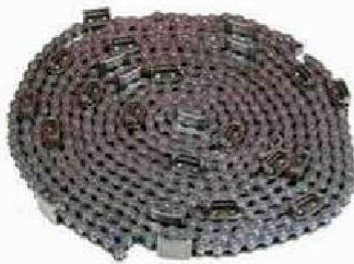
03-63 ▶ 03-77