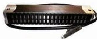
17-32 ▶ 17-35